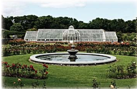
The Rose Garden and Victorian Conservatory